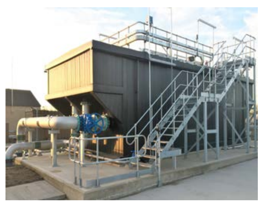
Aquardia HDPE rectangular vessel

TEL: +44 (0) 1234 750 422 EMAIL: marketing@framatomebhr.com www.framatomebhr.com